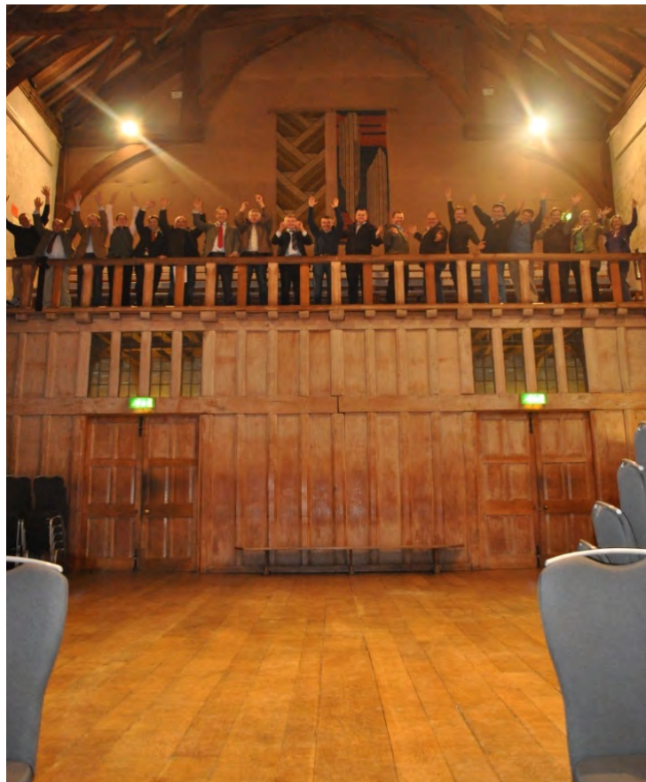
CRL class of 2010, spending some time on 'The Balcony'

I would highly recommend the “Challenges of Rural leadership” course to anybody who is offered the opportunity. The course has instantly changed the way I go about certain tasks from subtle changes in the way I deal with family members and employees, to bigger picture issues in relation to my involvement in industry. It was a chance to step back and analyse myself and my business with the unique opportunity of 18 new friends’ comfortably offering constructive criticism. Scary but an amazing feeling!