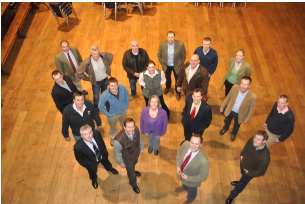
CRL class of 2010 "bustling on the dance floor"

Understanding the big picture was consistently highlighted with strong importance. The object of this was to remove yourself from the busy 'dance floor' more commonly the hustle and bustle of day to day life. 'To keep your eye on the prize' is another way to describe the metaphor, don't be blindsided by the immediate task at hand. As I am sure everyone finds themselves stuck in the mould from time to time.